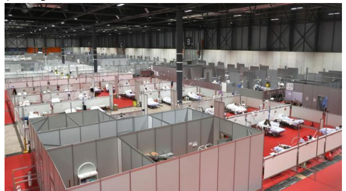
The field hospital set up at Ifema, Madrid's exhibition center.

The first COVID-19 active case in Spain was confirmed on 31 January 2020. The Spanish government declared a state of emergency on March 14, issuing a nationwide confinement order. Non-essential shops, schools, hotels and tourist accommodation were ordered to shut completely for two weeks, then workers in construction and manufacturing were allowed to return to work, although other restrictions were extended for the general citizens. Spain also closed its external borders with its European neighbours. Medical professionals and those who live in retirement homes have experienced especially high infection rates. On 25 March the death toll in Spain surpassed that of mainland China. The actual number of cases and deaths is believed to be an underestimate due to lack of testing and reporting.