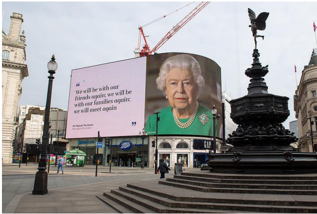
A message from the Queen Elizabeth II in Piccadilly Circus.